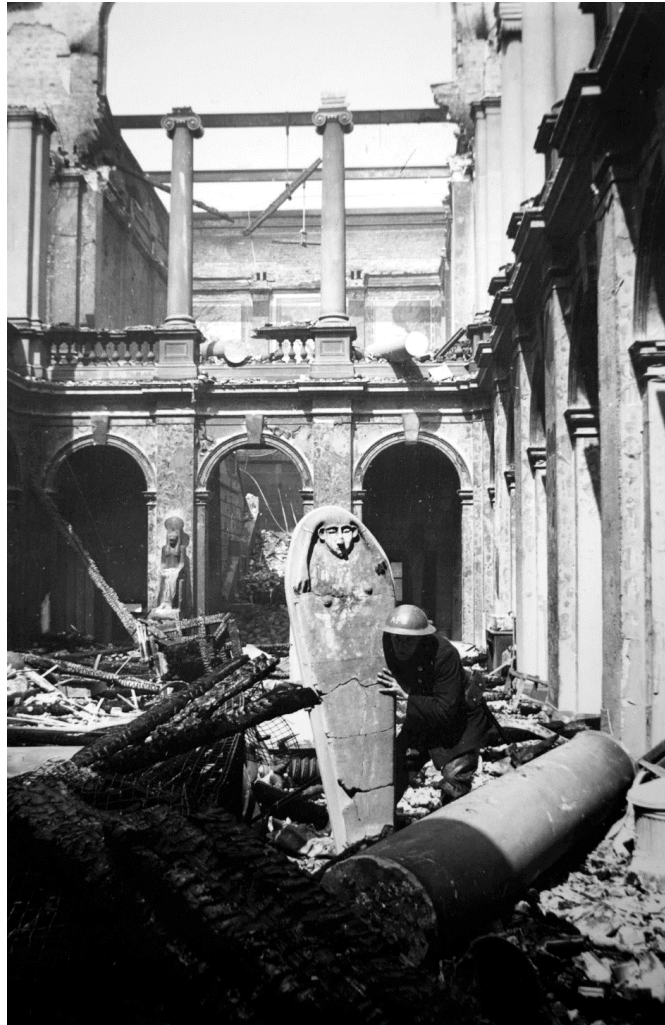
Figure 1 Bomb damage at the Liverpool Museum, 4 May 1941. A member of the Auxiliary Fire Service carries a coffin from Garstang's excavations at Esna, 1906.