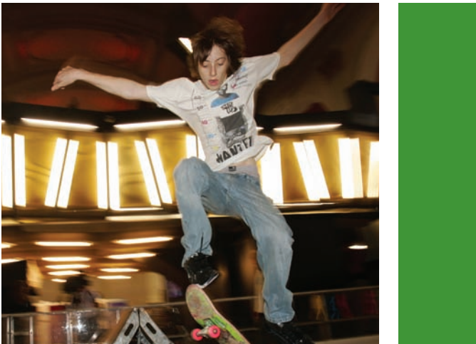
OPEN, myplace project, Norwich

There are numerous examples of successful projects that have given young people new opportunities to directly influence decisions in their communities.