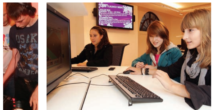
OPEN, myplace, Norwich